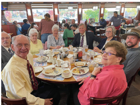
5th Sunday at St. Isaac Joques and Double T Diner in October. There was a better than usual turnout this month, and we had to have two tables for the brunch. Don't forget that December has a 5th Sunday on the 31st, but this has been canceled so that each family may celebrate the New Year in their own church and manner.